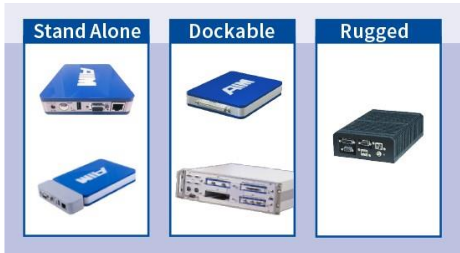
ANET product family

The ANET product series is available in Lab and Rugged configurations and supports both MIL-STD-1553 and ARINC-429 protocols with 10/100/1000 Ethernet. It is the perfect off-the-shelf and proven solution for implementing an Ethernet/Avionics gateway and will meet your objectives with optimal efficiency.